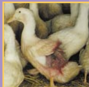
An appalling injury which has been ignored

Like them, they would love to fly at 50 mph, to choose a mate and to live for 15 years or more. Fly? Some can hardly walk because of leg deformities. There's no mating and life ends brutally after seven weeks. Many will be fully conscious when their throats are cut.