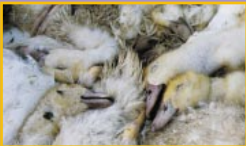
A bin full of dead ducklings – an everyday scene 'down on the duck factory farm'

Meat producers have learnt nothing from their abysmal past failures. Not satisfied with bringing us cannibalism, BSE, E.coli, Salmonella, antibiotic-resistant killer bugs and mass animal abuse, they've done it again. Beautiful birds, still driven by a powerful call of the wild, are being denied all freedom in stinking factory farms – while those responsible boast about it.