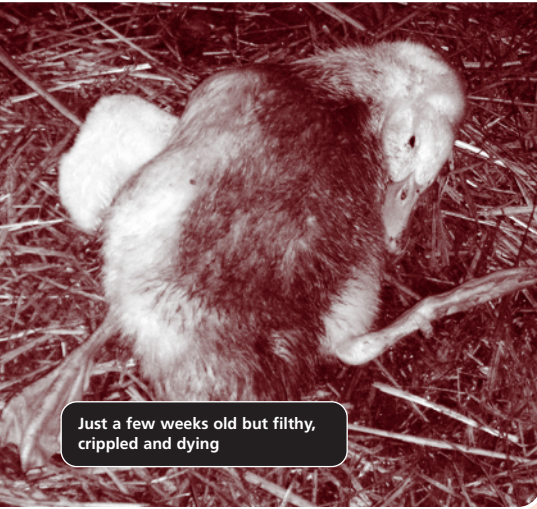
Just a few weeks old but filthy, crippled and dying

Is this what you expect from a store which claims to be ethical?